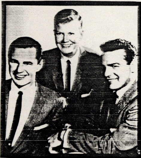
Billy Tipton (center) in the 1950's