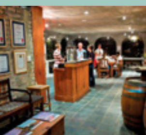
BOUCHARD FINLAYSON 25