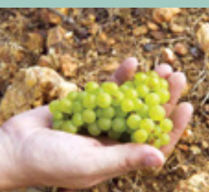
HAMILTON RUSSELL 26