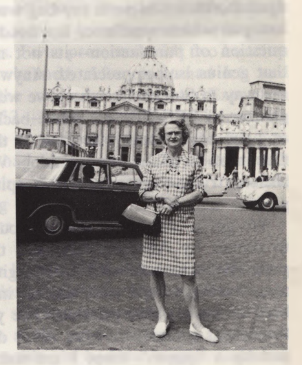
Lady Tourist in front of St. Peters.