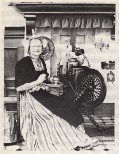
Little Dutch Girl