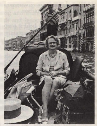
"Bag" and Baggage Grand Canal—Venice