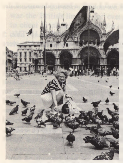
"It's for the Birds" Piazza San Marco Venice, Italy