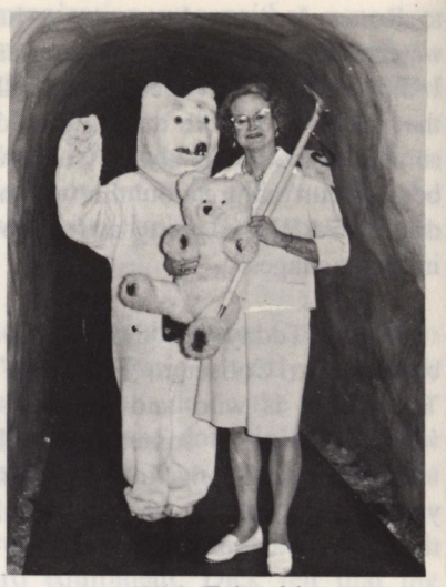
With Friend in ice cave in Rhone Glacier—Switzerland