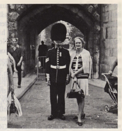
Most photographed man in England with visitor to Tøwer of London