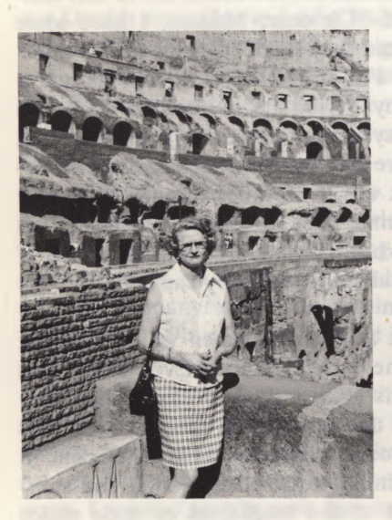
Pair of old Ruins