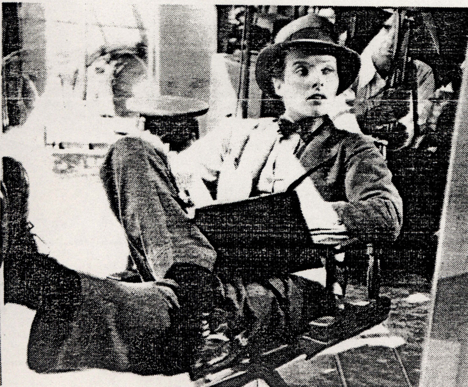
In the film Sylvia Scarlett (1935), Katharine Hepburn plays a boy who teams up with Cary Grant as con artists in Victorian England. See this delightful dark comedy at the Castro Theatre, Castro and Market Streets in San Francisco, on Wednesday, January 25, 1989 at 4:10 and 7:35 p.m. George Cukor directs.