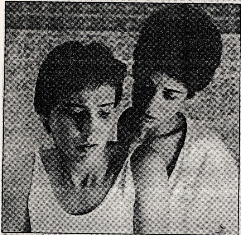
A scene from Vera

On the down side, I occasionally found "Vera" confusing. I think that this can be attributed to an art school overdose on the part of the filmmaker. Sometimes it was hard to tell what was going on where - was she at work or was she still at the orphanage? I like non-narrative films, but the non-narrative feeling that was written into this movie, which is basically a straightforward narrative, weakens the film overall. In any case, I recommend it - a strong, moving film.