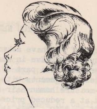
STYLE D. 8-10" HAIR 4" PARTING