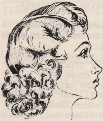
STYLE E. 14-18" HAIR 4" PARTING