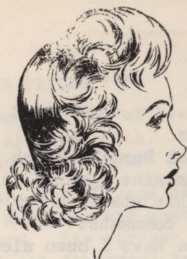
STYLE L. 15" HAIR AT NECK, 4" PARTING