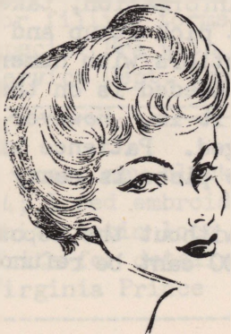
STYLE I. 5-6" HAIR NO PARTING