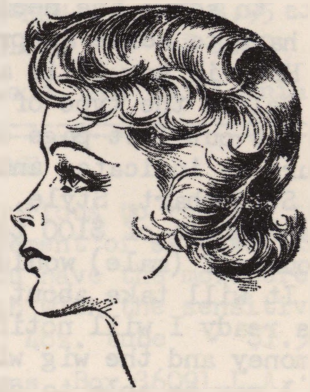
STYLE F. 5-6" HAIR 4" PARTING