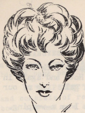
STYLE K. 5-6" HAIR NO PARTING