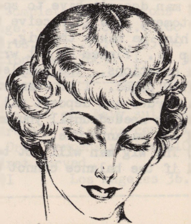
STYLE G. 5-8" HAIR 2 1/4" PARTING