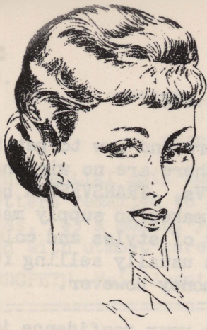
STYLE B. 8-10" HAIR NO PARTING