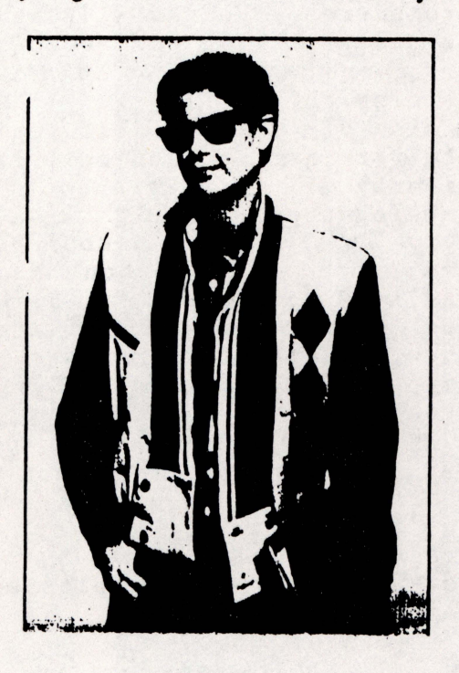
IN THE BOOKSTORES

Have you seen the film My Life As a Dog? The leading actor's best friend is a female-to-male approaching adolescence. There is even a scene in which he helps her bind her breasts. Check it out! A first-run film, now playing at a theatre near you!